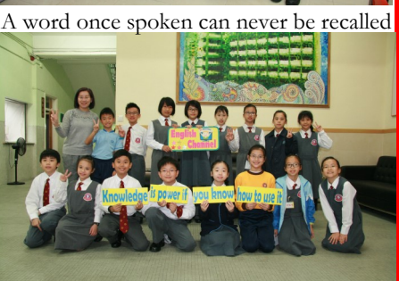
Knowledge is power if you know how to use it