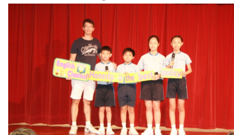
Honesty is the best policy