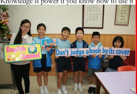
Don't judge a book by its cover