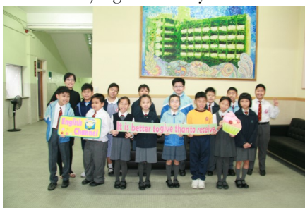
It's better to give than to receive